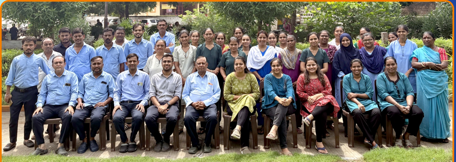
Shrimati Santokba Bhagwati General Hospital, Dholka Staff