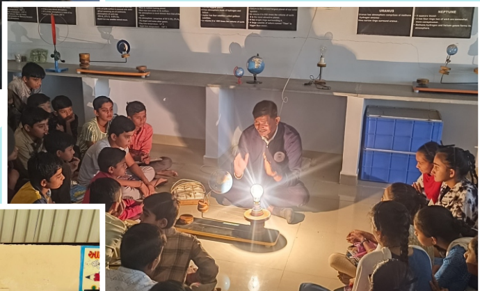
Teacher explaining the seasonal cycle to students through a model