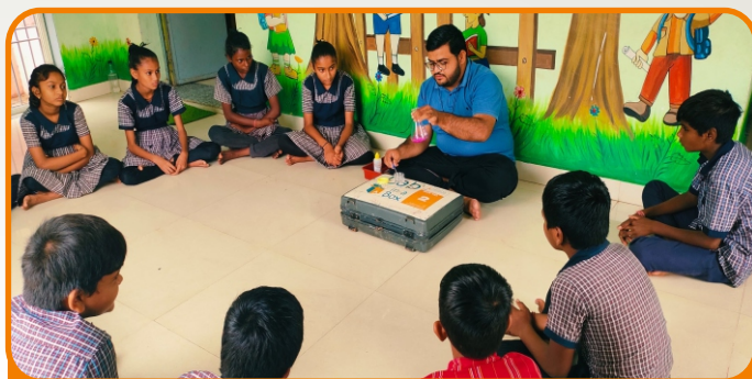
Teacher explaining the neutralization process of acids and bases to students.