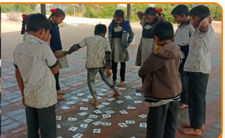
Students Acquiring Number Knowledge Through Activities

With such a weak foundation, education beyond grade 5 becomes ineffective, and these students may struggle in their future careers, ultimately becoming a burden to their families and society. Recognizing the urgent need to improve this situation, our Trust adopted Dr. K.R. Shroff Foundation's method to address the deficiencies in reading, arithmetic, and writing which is called " Bridge Course. "