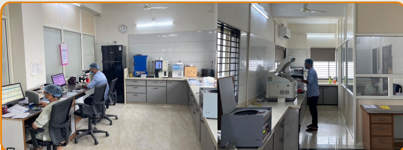
The Hospital's Pathological Laboratory is Equipped with Modern Equipment and Facilities.

We sincerely thank the following institutions and dignitaries for their help and cooperation in planning and implementation of various public utility programs and activities of our Trust.