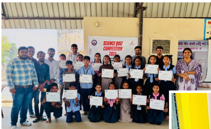
Science Quiz Competition - 2025