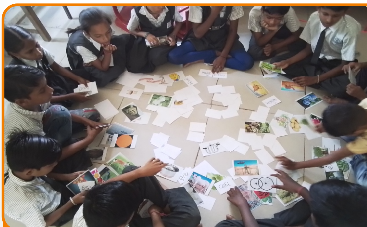
Students identifying words through a picture-word matching game

Due to the COVID-19 pandemic, schools were closed for the two years in the recent past. As a result, foundational learning in reading, arithmetic, and writing was significantly weakened among students of grades 1 to 3 during that time. Additionally, under the previous education policy, students were promoted to higher grades without examinations, which further deepened the learning gaps in these basic skills.