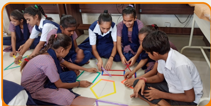
Students gaining an understanding of quadrilaterals