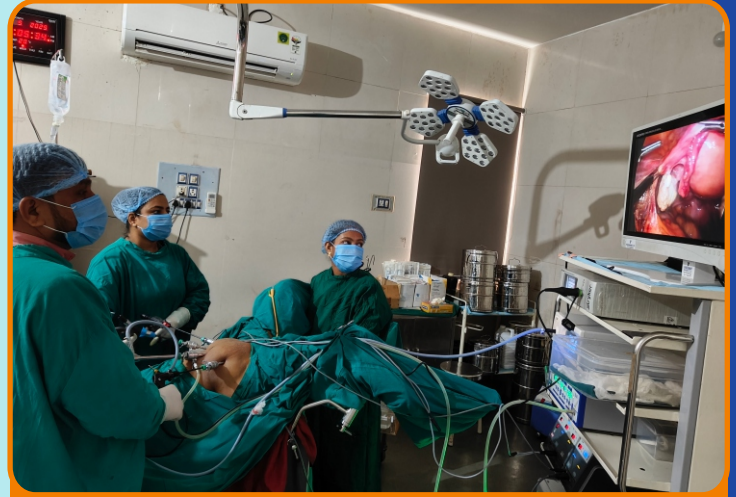
Laparoscopic Uterine Surgery