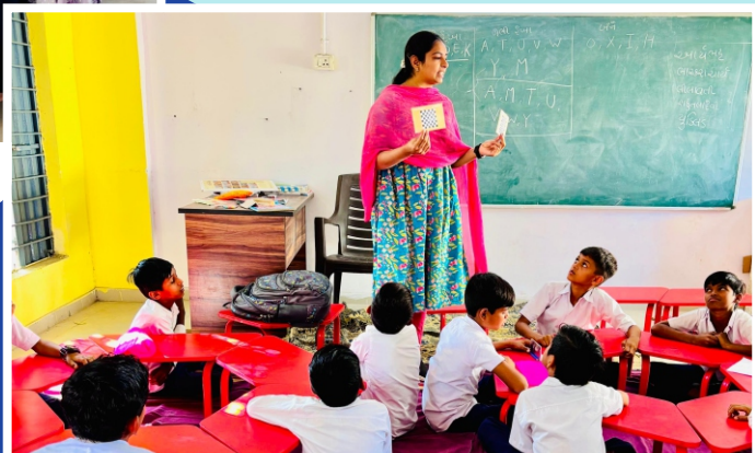
Teacher explaining symmetry to students