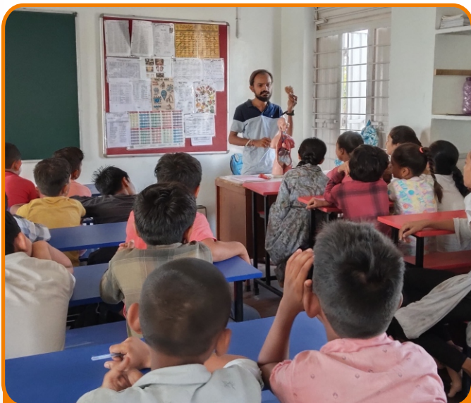
Teacher explaining human body parts to students

Teachers from the Trust teach mathematics and science concepts through activity-based methods to students of grades 6 to 8 in 34 rural schools . These concepts are in alignment with the government curriculum. These methods naturally stimulate students' curiosity.