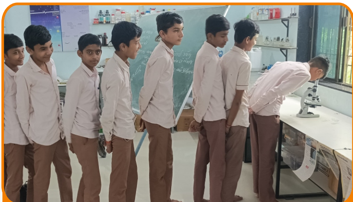
Students looking at onion cells under a microscope

In the past year, a 3D printer was also installed at the center, which plays a vital role in driving students' creativity and innovation.