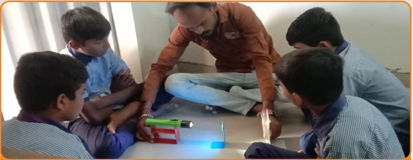
Explaining the principle of how light shadows are formed.

Science study kits have proven to be very effective in reinforcing the learning of the subject. 2992 students of class 6 to 8 took advantage of this initiative.