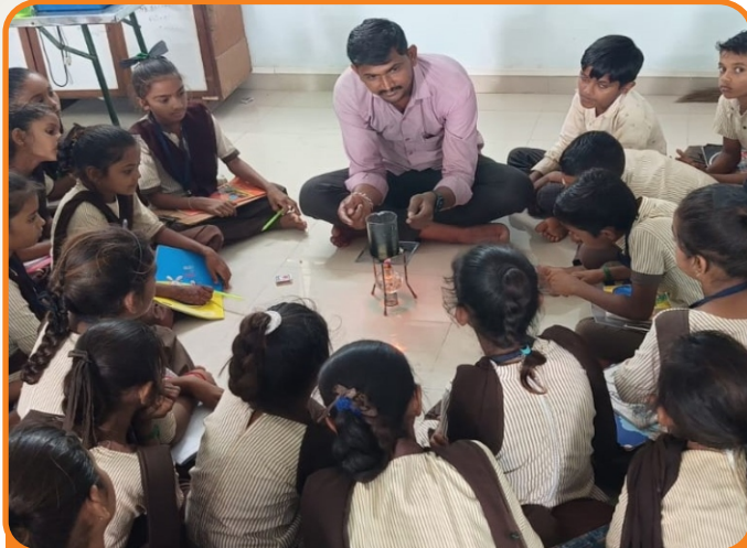
A teacher demonstrating a science activity at the Aavishkar Science Kendra

More than 65 government and non-government primary school students from the rural areas of Palitana, Talaja and Shihore talukas surrounding Maydhar come to Aavishkar Vigyan Kendra at their own expense and learn the principles of science by doing various activities included in their science curriculum.