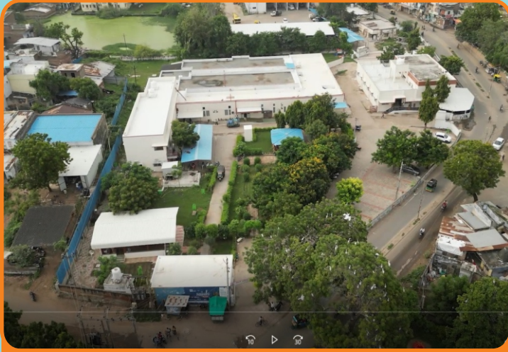
Bird eye view of Smt. Santokba Bhagwati General Hospital complex