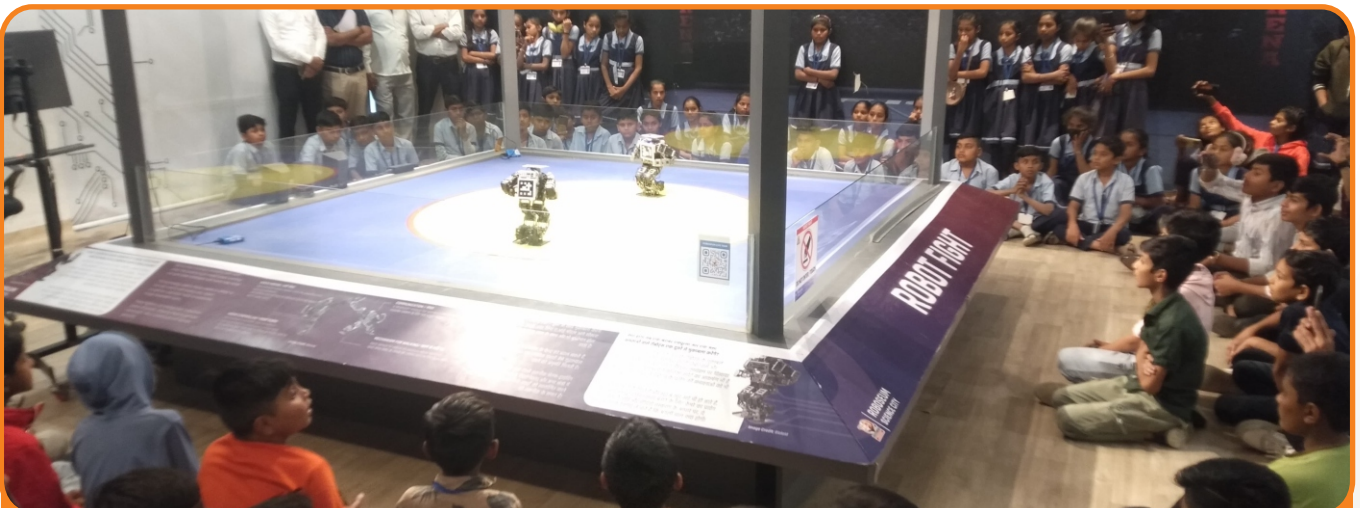
Students enjoying robot fight at the Robotics Gallery during their educational tour to Science City