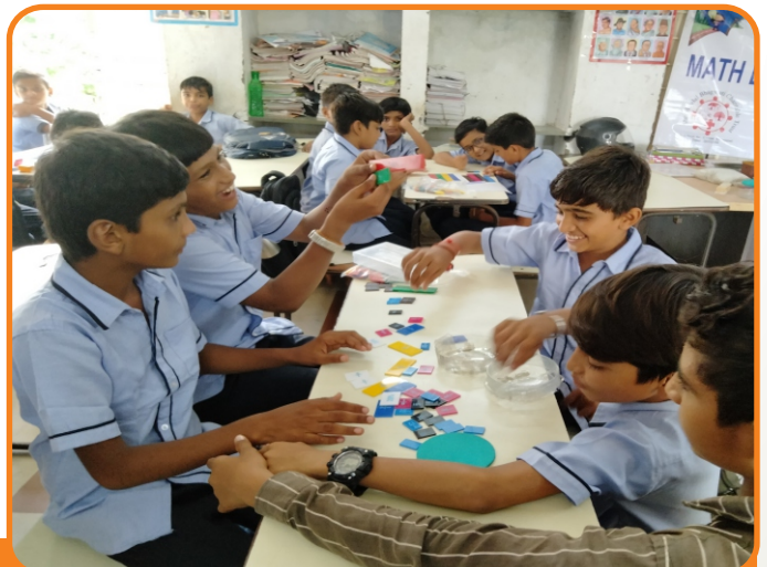
Students learning mathematics with the help of study kits made by Agastya Foundation