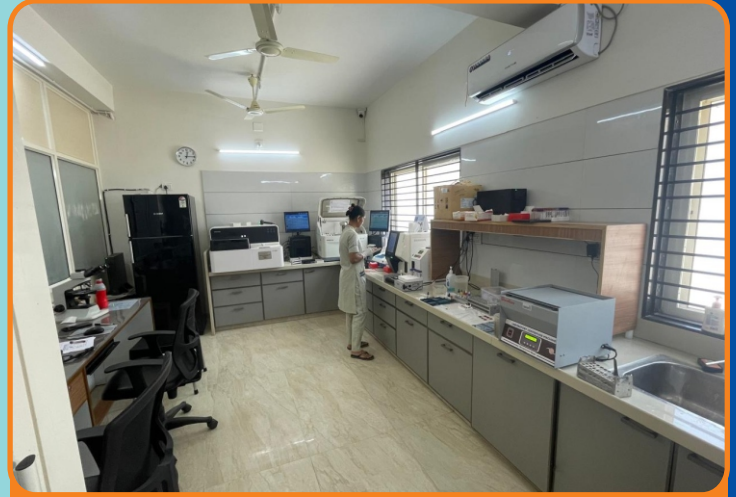
Modernised Pathology Laboratory