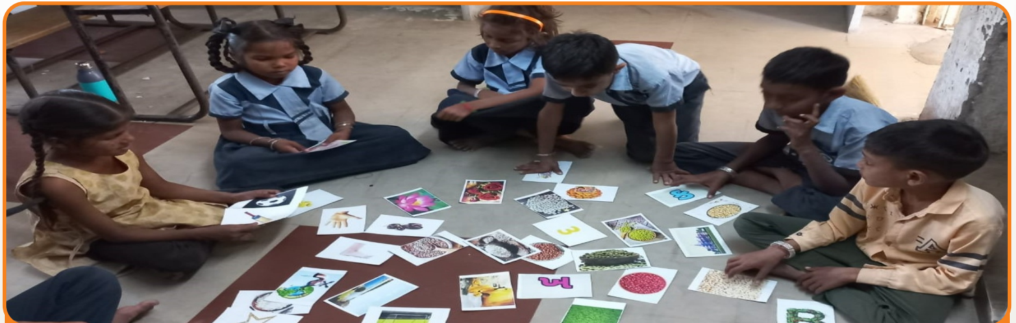
Children recognizing of letters from pictures.

In the previous year, we have identified weaknesses in reading, numeracy and writing ability of children. Due to the closure of schools during two years of Corona Pandemic, this weakness has become more acute in the current students of class 2 and 3. A poor understanding of the basics makes further studies more difficult so to overcome this basic deficiency, Dr. K. R. Shroff Foundation has developed a defined methodology.