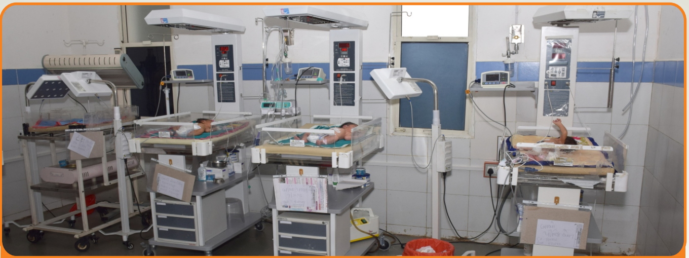
NICU room equipped with modern equipment and facilities for new born babies at the hospital.

This year 118 Laparoscopy Surgical Procedure were done to make hysterectomy less painful and quicken the recovery.