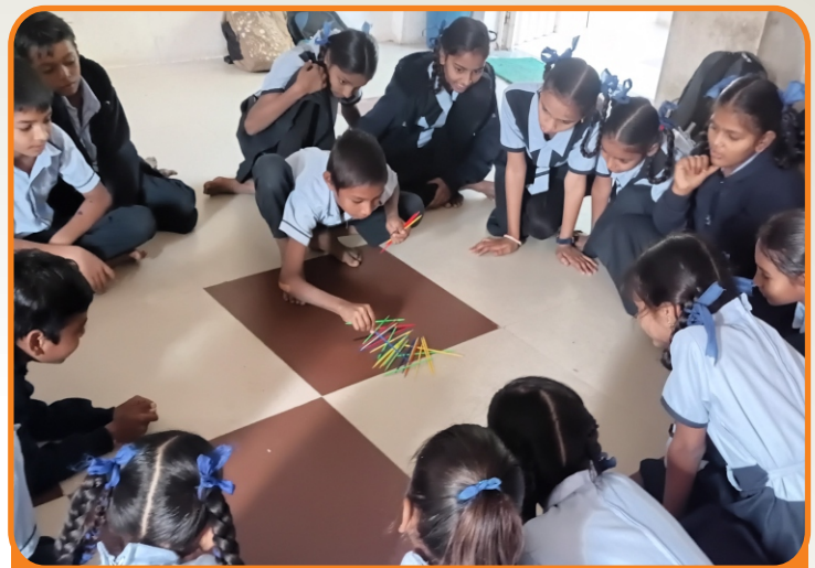
Students learning addition through a game called Mikado during a bridge course.

Apart from the 'Bridge Course', the main course as per the syllabus of each standard is taught and evaluation tests are conducted from time-to-time. Test results are uploaded on the portal. The reports on the portal help evaluate how effectively each student has improved in his / her performance. Through this Bridge Course, 756 students studying in 3rd to 5th standard improved their ability of reading, numeracy and writing.