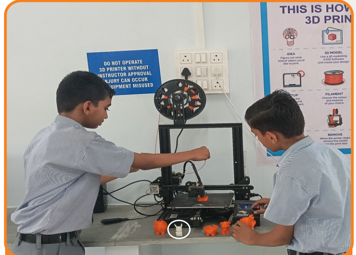
Animal models made by 3D machine

Activity-based science education is imparted by qualified and experienced science teachers at Aavishkar Vigyan Kendra. During the year, a 3D printer machine has been installed in the Aavishkar Vigyan Kendra. This machine will be very useful to bring out the creativity of the students.